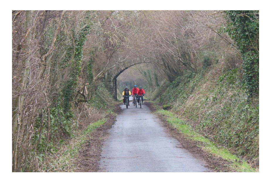
Disused railway line and route of the Tarka Trail, Landcross.