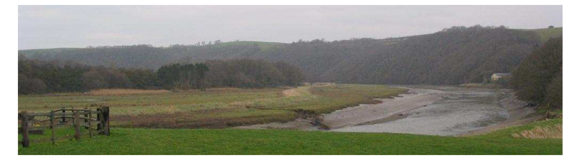
Part of Torridge CWS: Pillmouth Marsh