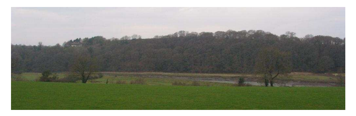
Pillmouth Wood in distance