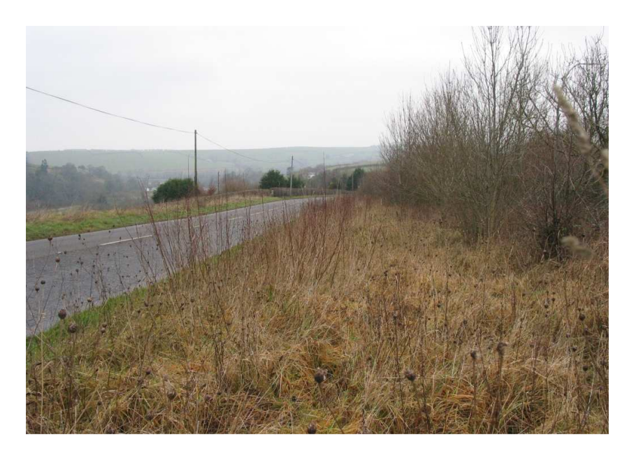
Road-side verge, Landcross parish.

The embankments of the disused railway line have varying densities of trees along its length. The trees species recorded here on the site visit include oak with ash, hazel, and birch. The banks are predominately shady and covered with ivy and hart's-tongue fern. Other species recorded along the length of the railway line within the parish include primrose, wood sage, pendulous sedge, figwort, wood sedge, bramble, creeping buttercup, dog's mercury, soft shield-fern, foxglove, wood avens and common sorrel. There is also a tunnel, which might provide a suitable habitat for bats.