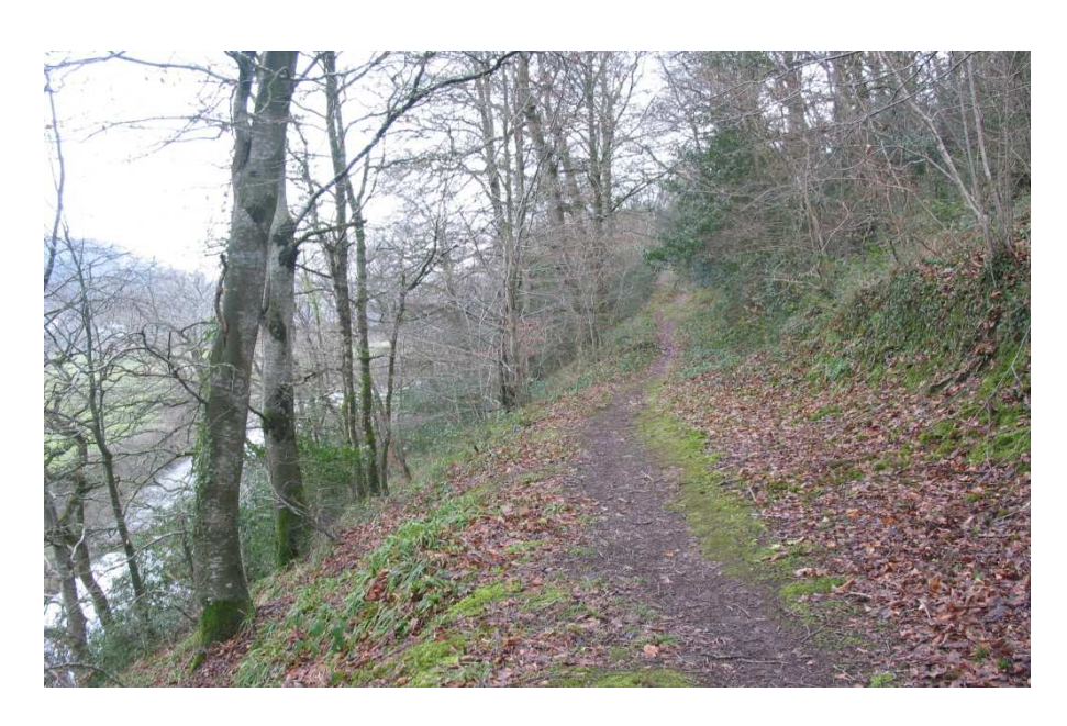
Woodland north-east of Mill Bridge