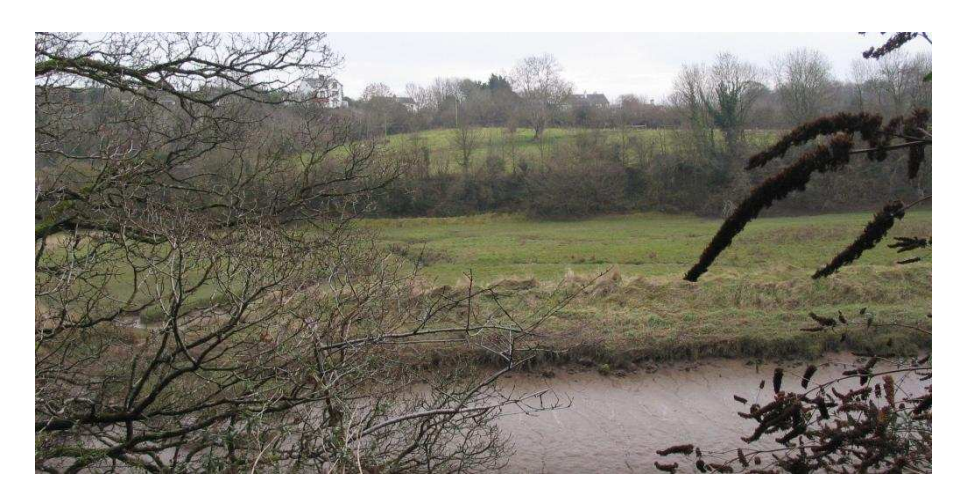
Part of Torridge CWS: Watertown