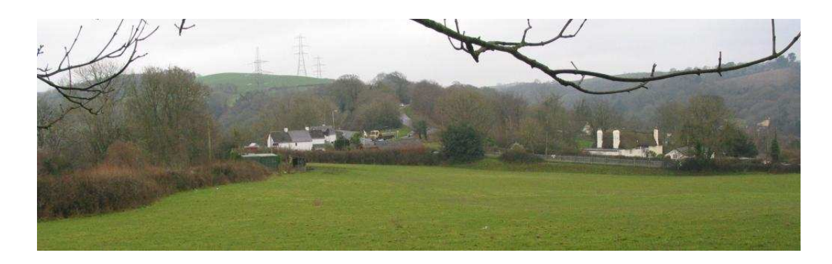
View of Landcross from near the church

The parish site visit for this report was commissioned for and carried out in January 2009. It should be borne in mind that this is not the ideal season to carry out biodiversity surveys as some species will not be visible at this time of the year. A full species list recorded during the January site surveys is given in Appendix 2.