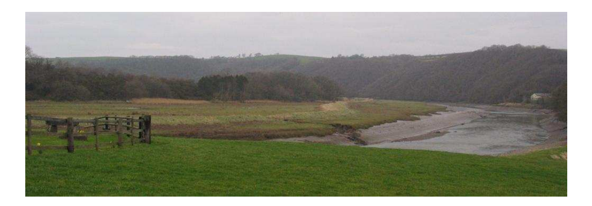
Centre-view shows part of Pillmouth Marsh