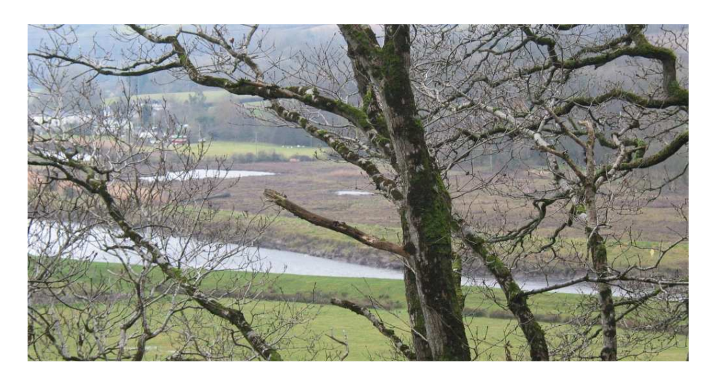
Halfpenny Marsh CWS viewed from disused railway