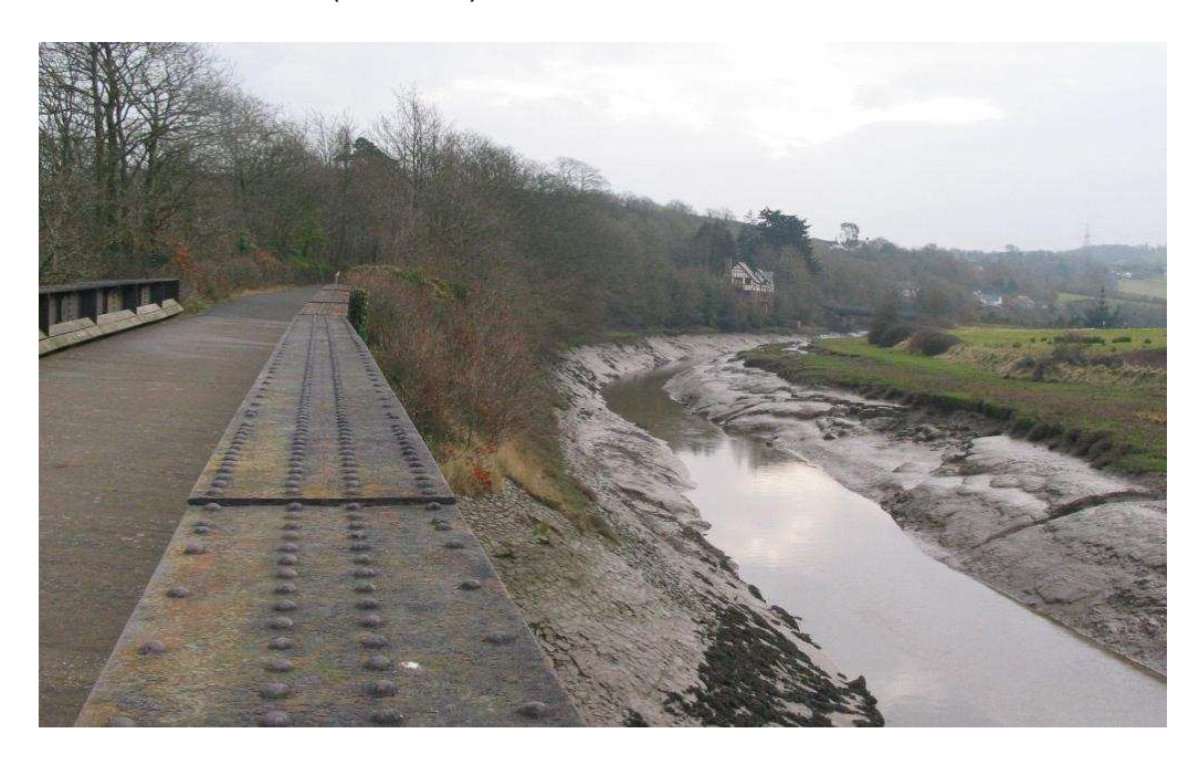
River Yeo and disused railway line near Pillmouth