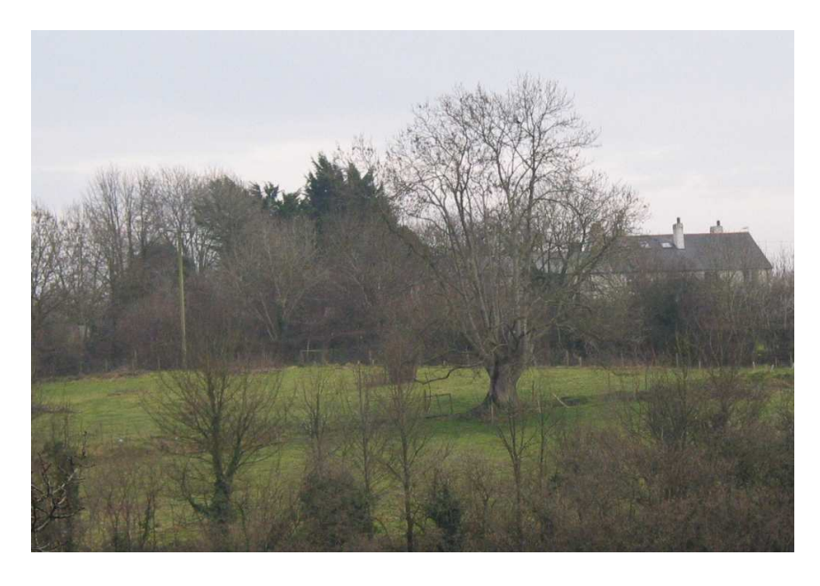
Possible veteran tree near Watertown

There is a possible veteran tree in a field near Watertown, and from aerial photos possibly one in a field east of Pillmouth. Some trees might be protected by tree preservation orders (TPO).