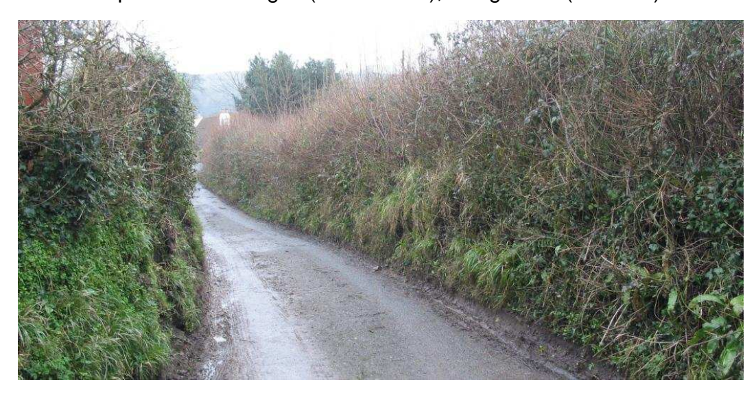
A typical hedgerow in Landcross parish

Species-rich hedges (Devon BAP); Hedgerows (UK BAP)