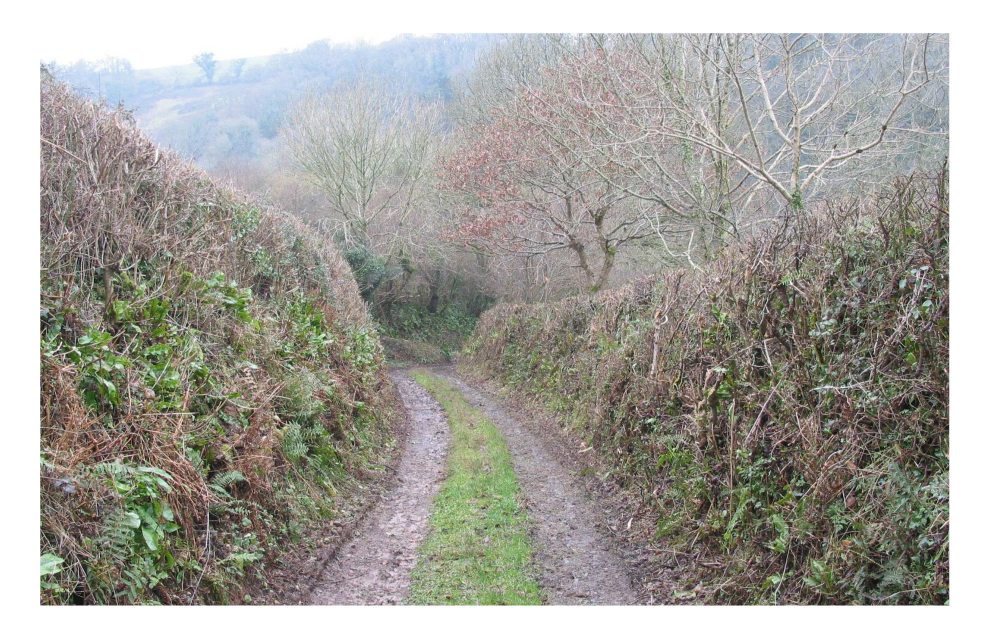
Green lane near Mill Bridge

Species-rich hedges (Devon BAP); Hedgerows (UK BAP)