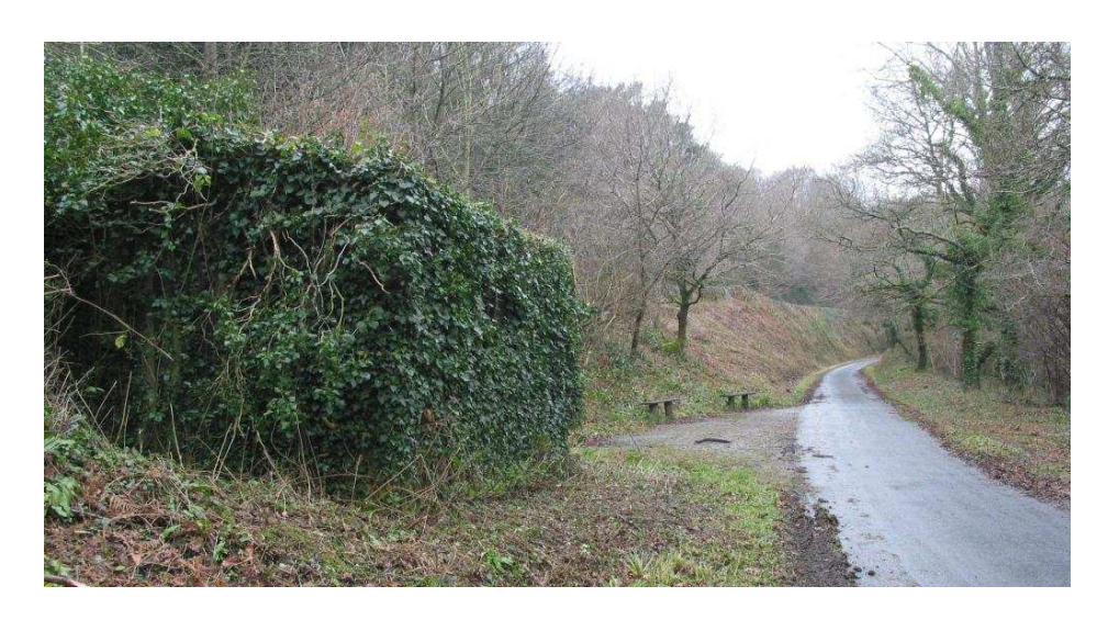
Redundant building on the disused railway line